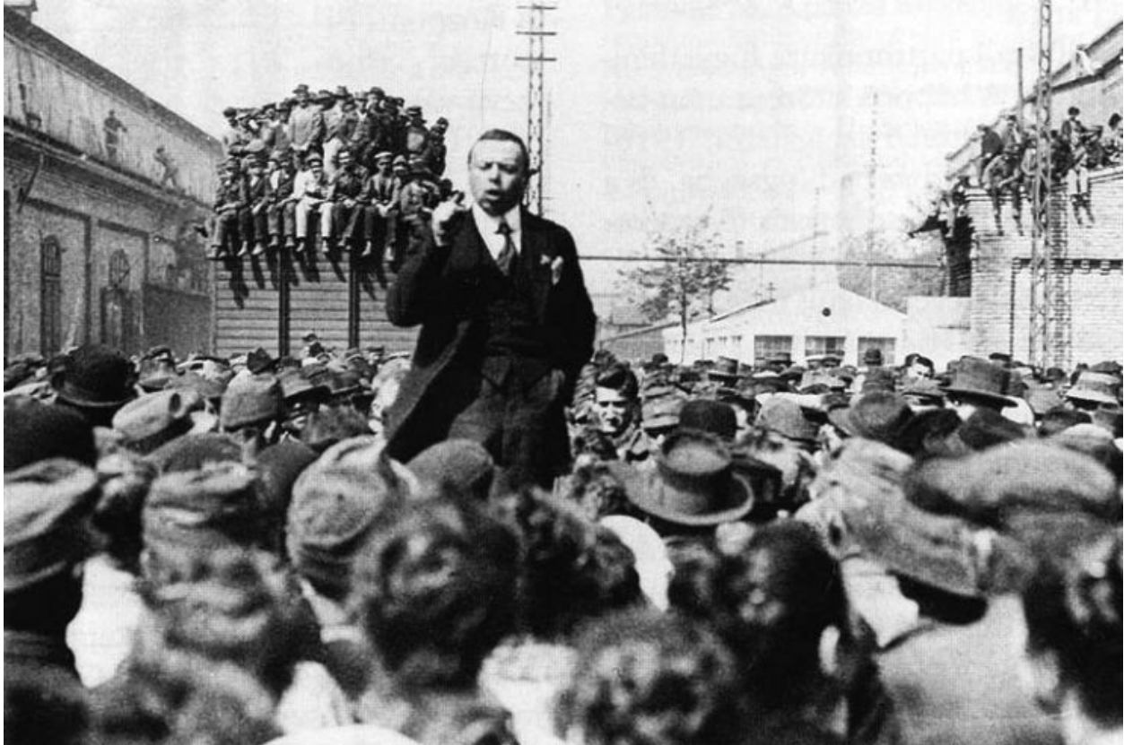
Béla Kun, leader of the 1919 Hungarian Revolution

Not that any of this was news; major politicians of the time knew it well. Lord Balfour, for example, once remarked to Wilson’s aide Edward House that “nearly all Bolshevism and disturbances of a like nature, are directly traceable to the Jews of the world. They seem determined either to have what they want or to upset present civilization.” [7]